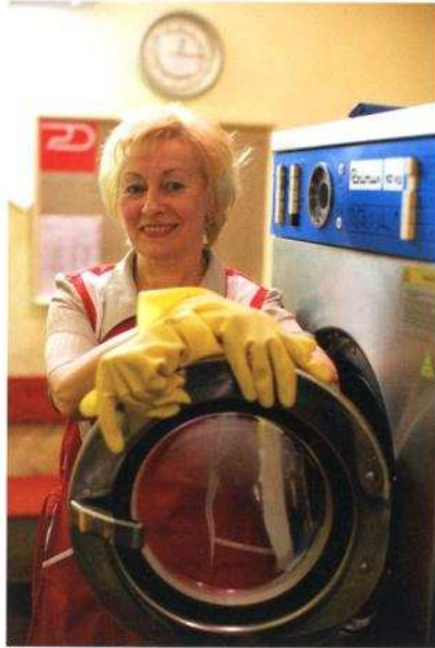
Since 2009, Dussmann Service has also been responsible for keeping the 185,000 square meters in the Santariskes Hospital clean, maintaining hygiene standards in the clinical areas and façade cleaning